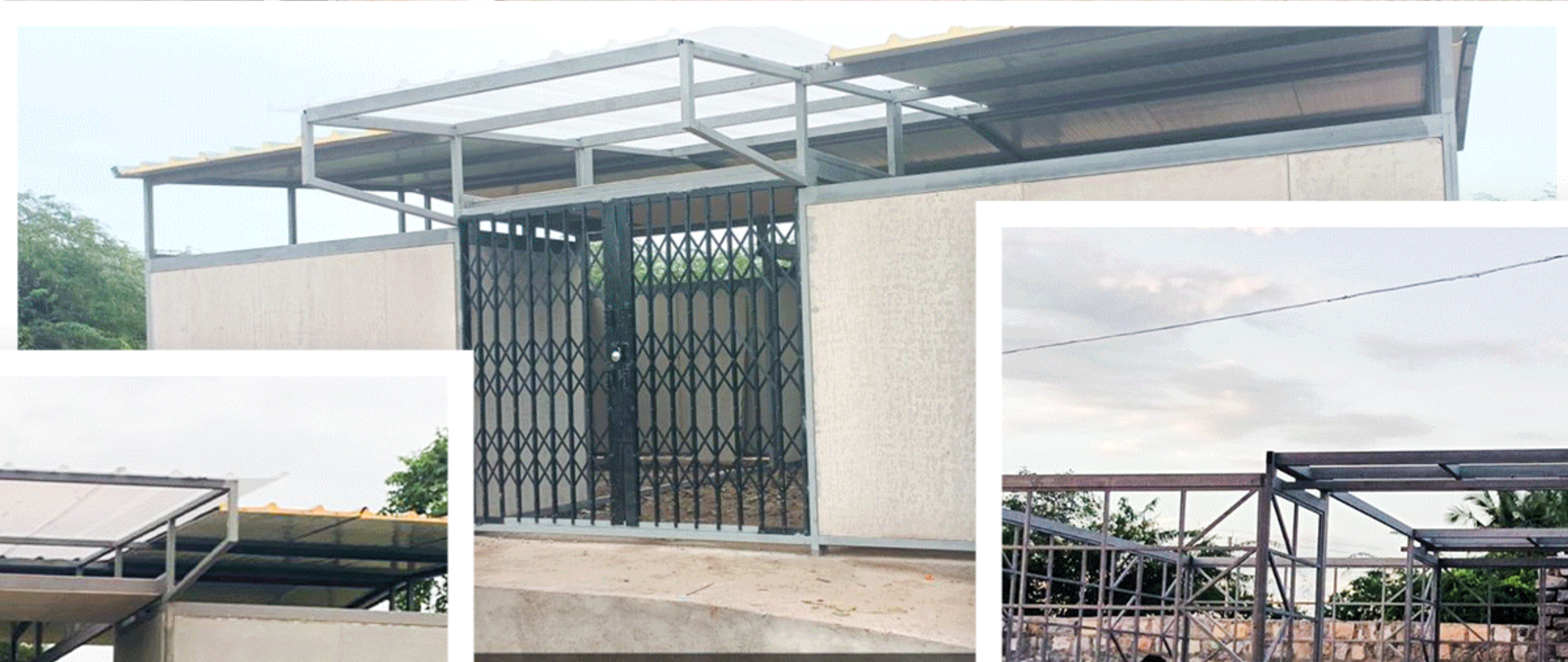
Hirebommanhal, Karnataka, India Hirebommanhal, Karnataka 583229, India